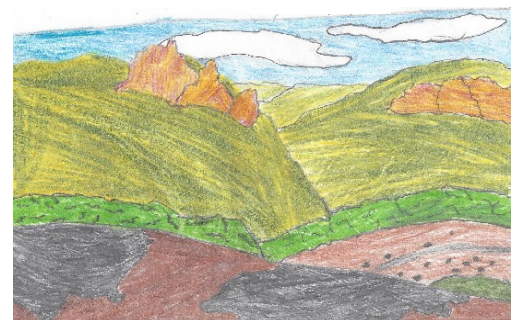
A Camper's View of the Mountains